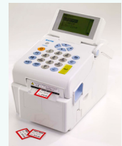
Dispense mode printing - separates label from backing paper