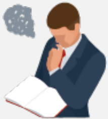
Study & create print string