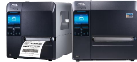
CL4NX Plus CL6NX Plus