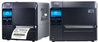
CL4NX Plus CL6NX Plus